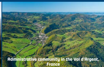
Administrative community in the Val d'Argent, France