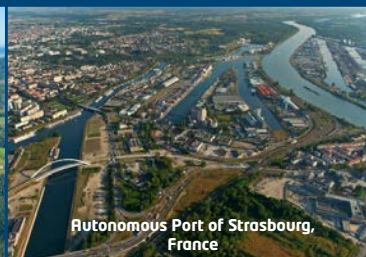
Autonomous Port of Strasbourg, France