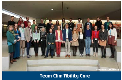
Team Clim'Ability Care

Clim'Ability Care wants to meet this challenge by exploiting the synergies between local experimentation, communication and awareness-raising